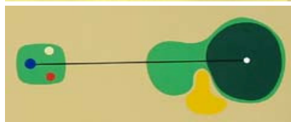
Hole 17 Par 3 Nearest the pin